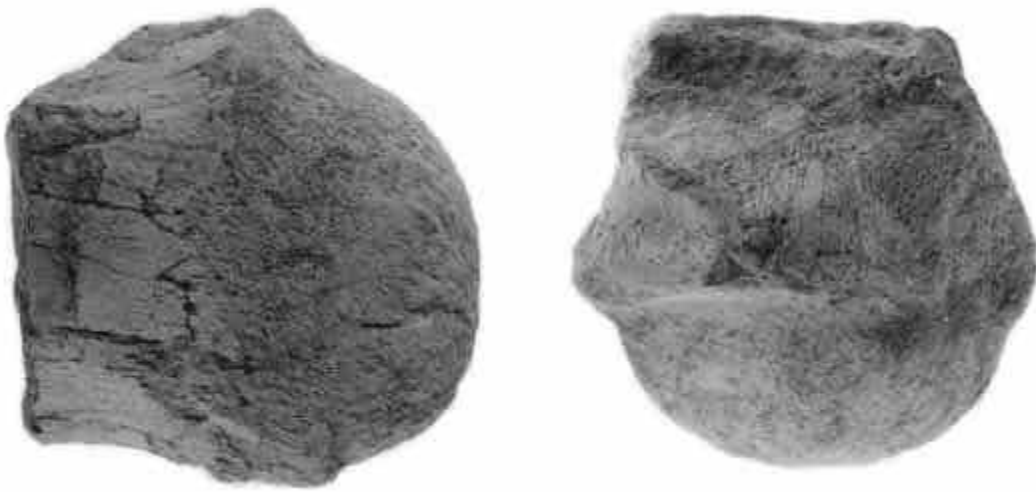
Figure 2. Titanosaurid caudal vertebrae (IGM 6080-2), from Chihuahua, Mexico. Right, lateral view; left, dorsal view. Scale x 0.91.