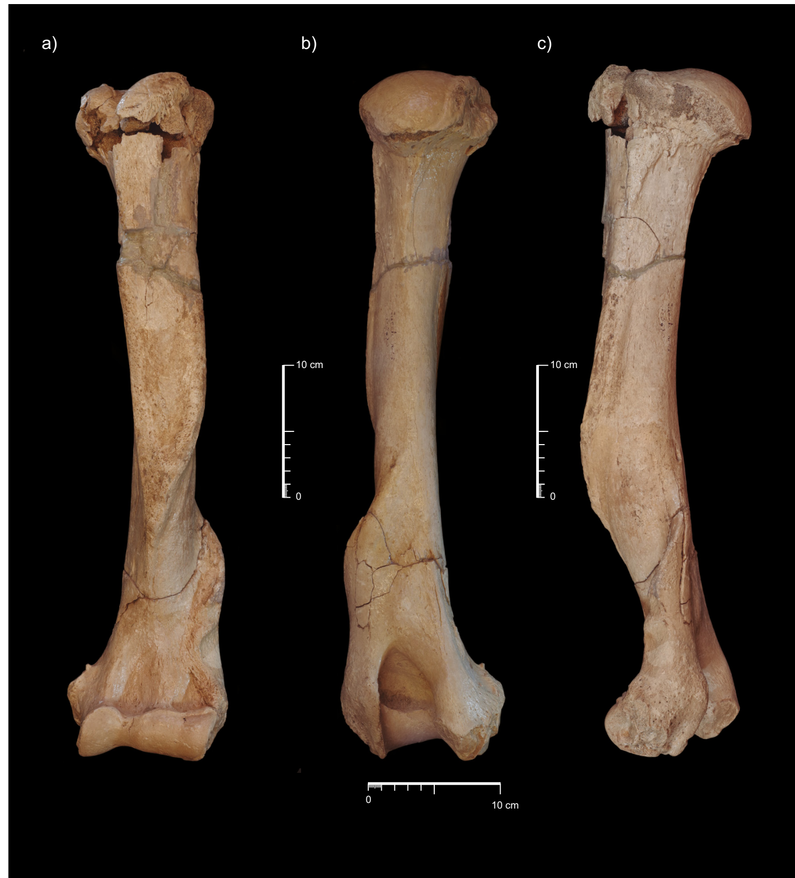
Figure S2. MPGJ 5676 Left humerus. a) Anterior view. b) Posterior view. c) Lateral view. Note the slightly prominent convex medial condyle.